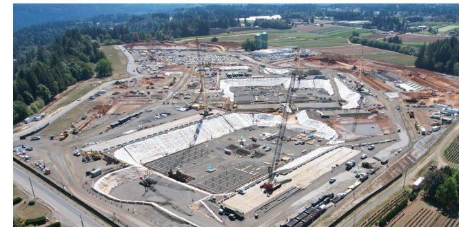
Facility site construction, August 2025

Hundreds of skilled workers are back on the job working on the filtration facility and associated pipelines. Construction is well underway to build the facility. When complete, the Bull Run Filtration Project will provide cleaner, safer drinking water to protect public health and comply with federal and state drinking water regulations.