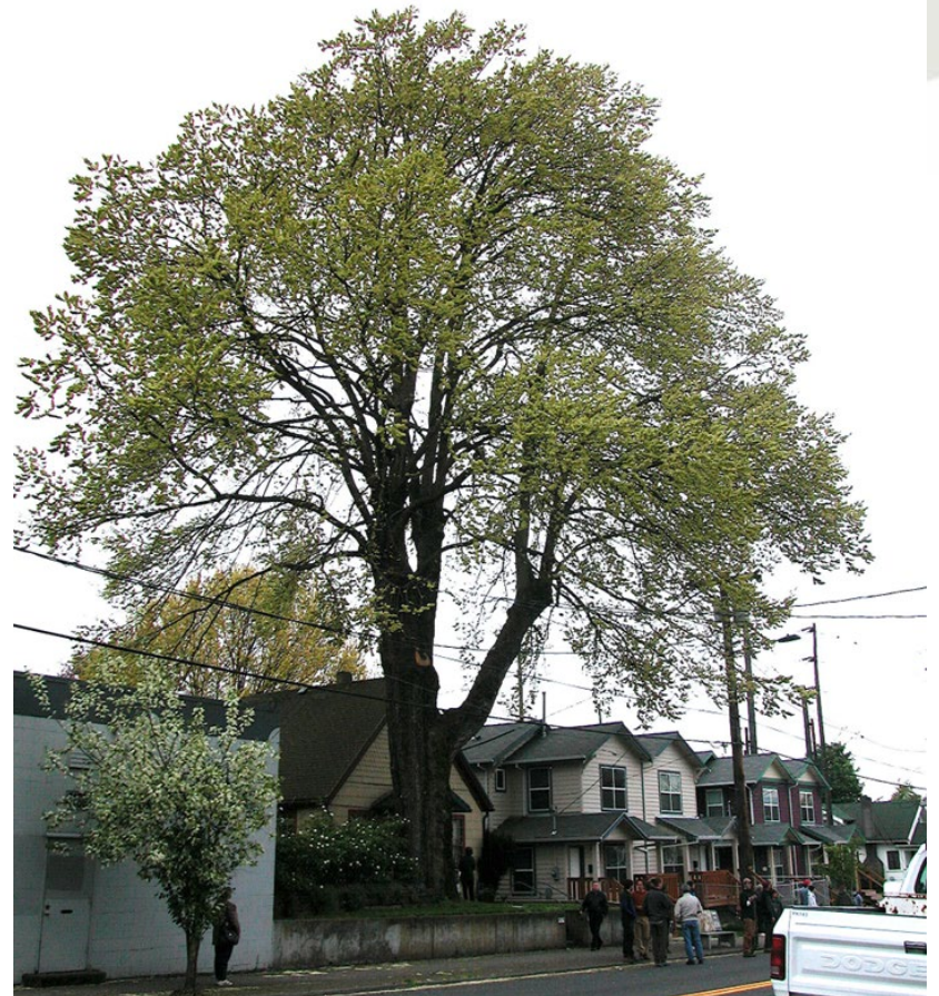
Heritage Tree #26