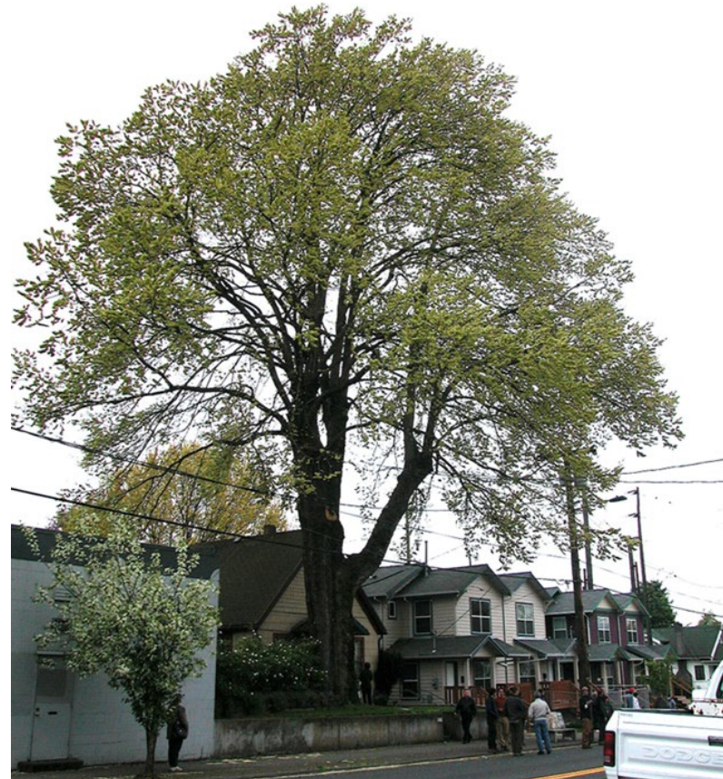
Heritage Tree #26