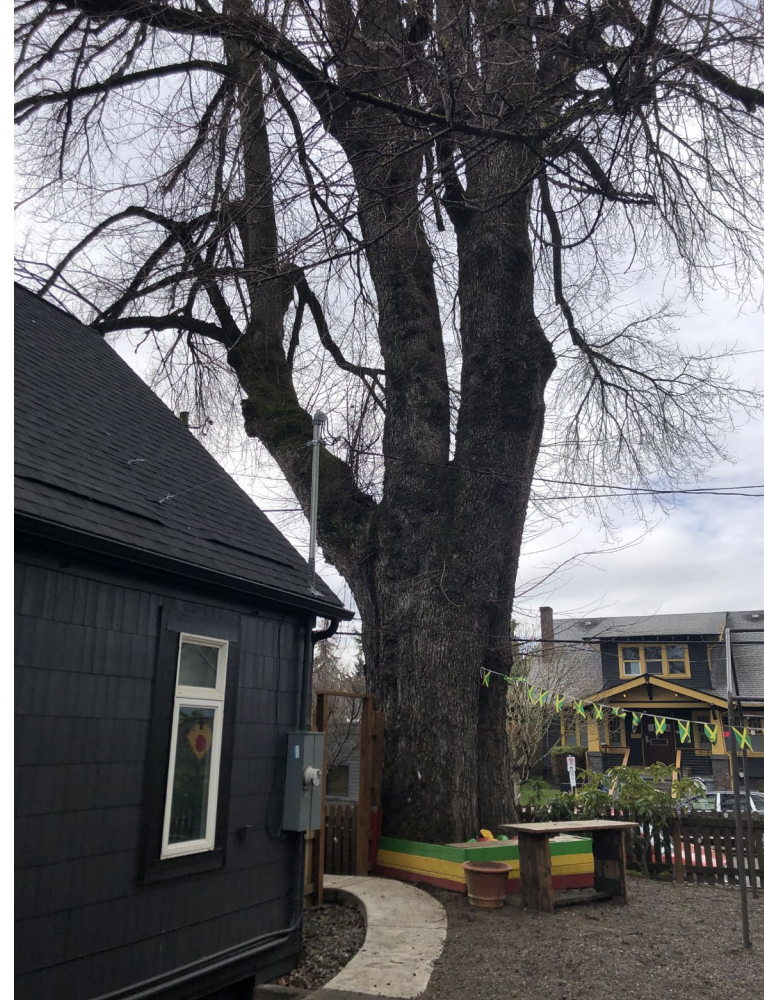
Heritage Tree #26