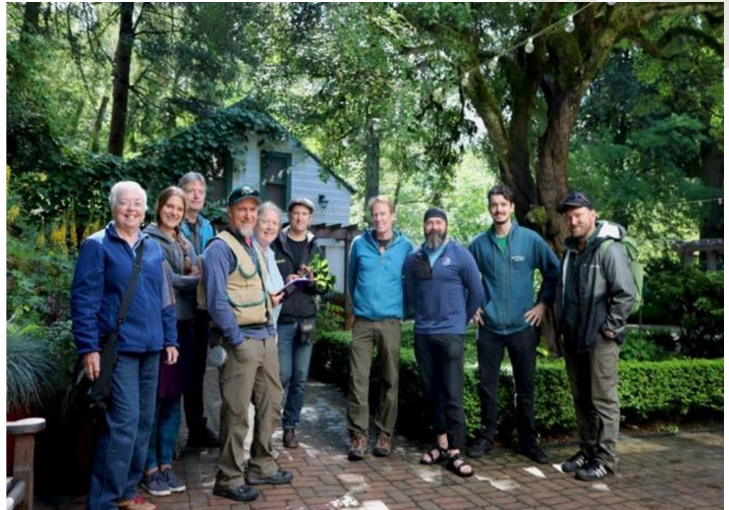
HTC at Leach Botanical Garden (2019)