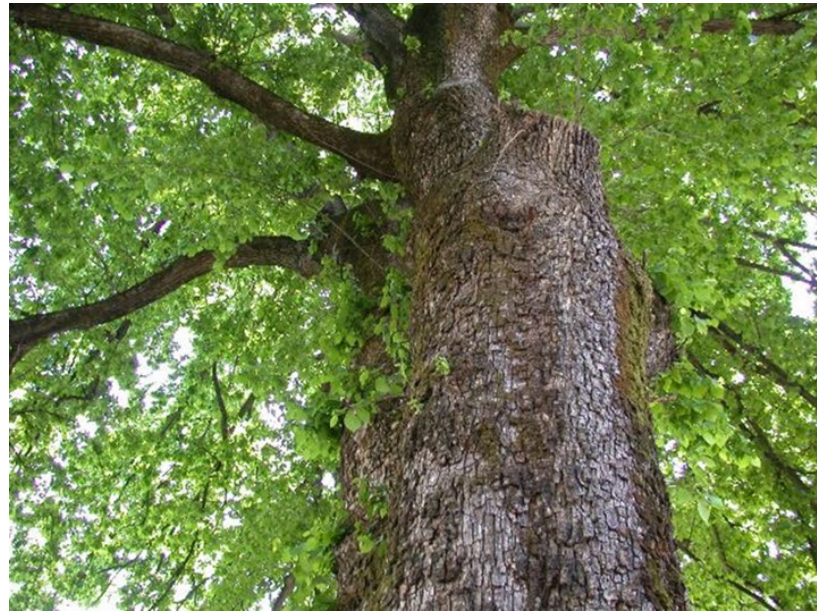
Heritage Tree #26

Vote to Recommend to Removal of Designation to City Council requires at least 6 votes