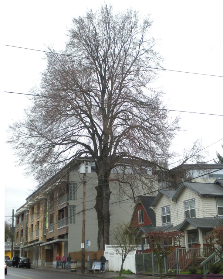
Heritage Tree #26