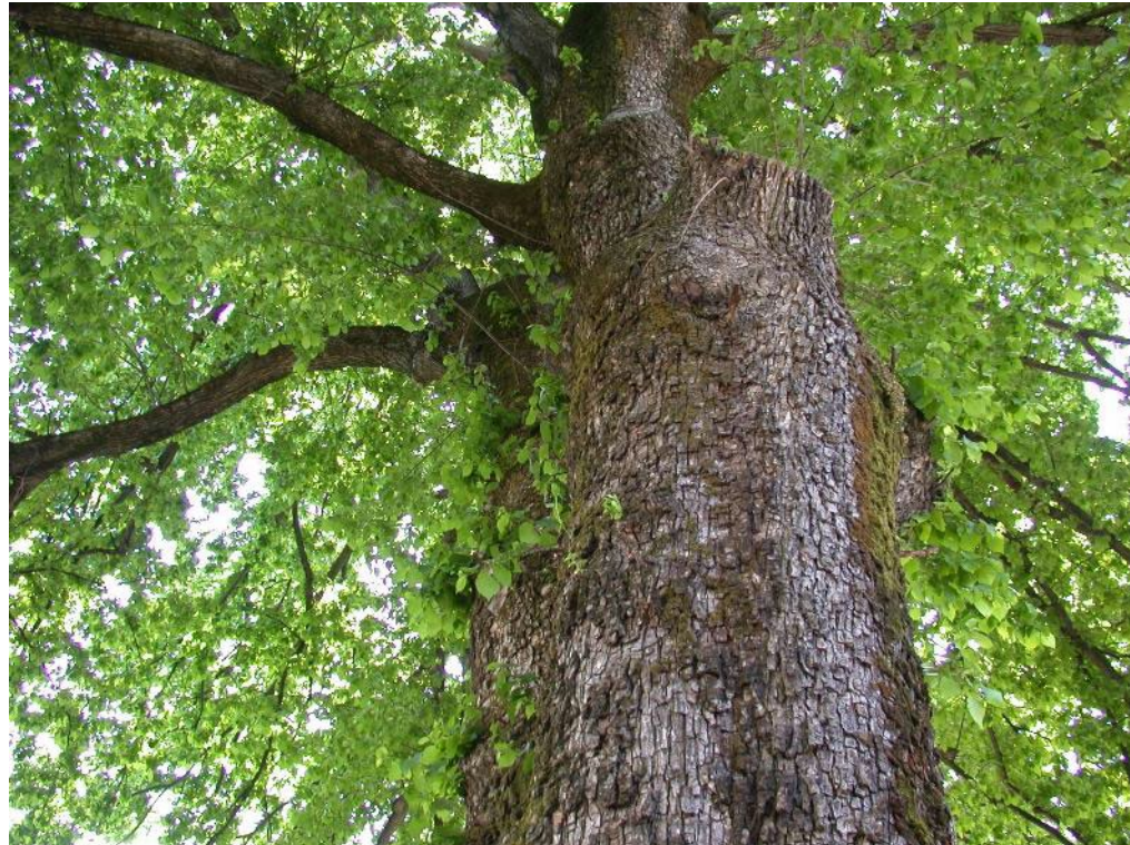
Heritage Tree #26