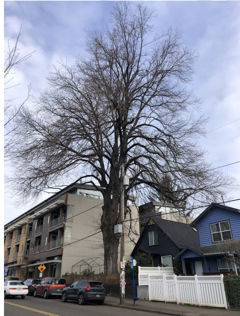
Heritage Tree #26