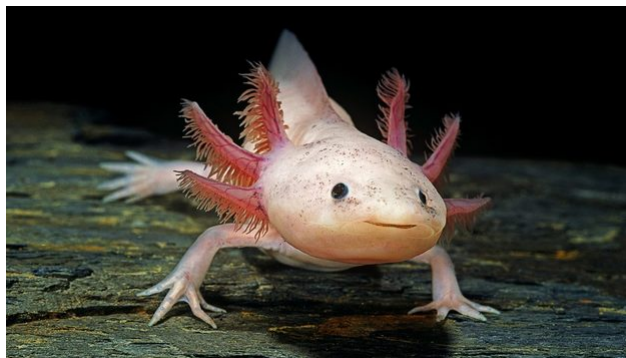
Photo 1: A tulip tree leaf. Photo 2: An axolotl, a species of salamander found in Mexico.