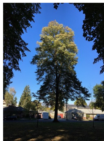
Photo 1: Young lindens planted in Columbia Park in 1920. Photo 2: A tall Silver linden found in the park today.