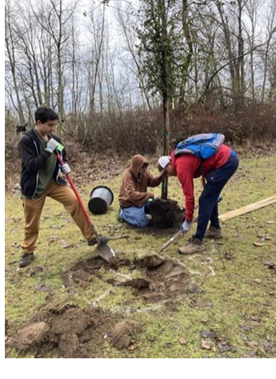
Photo 1: A volunteer holds a sign that reads Gurthie (name for the tree). Photo 2: Youth Conservation Crew members dig a hole for their tree.

Saturday, February 4th over 50 volunteers, including 8 of our Youth Conservation Crew members, gathered with us at Kelley Point Park to plant 19 trees. Though it was rainy and cold, there were lots of smiles and good conversations to get us through the day. Spread out in three different places on the northern end of the park, the crews worked fast to get those trees prepped, planted, and watered in record time. We are so grateful for the hard work of everyone who came out. Check out our Flickr to see pictures from that day.