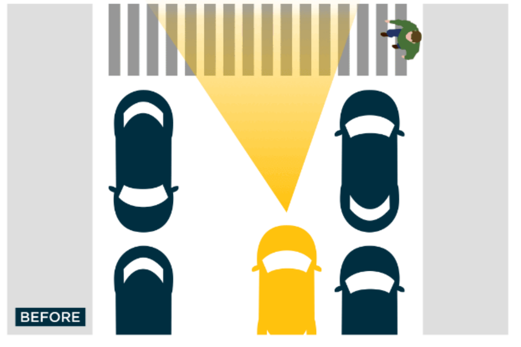
Here's how daylighting affects visibility. Graphic: Transportation Alternatives

State law requires this, but the City of New York overrides this life-saving requirement to prioritize parking over safety.