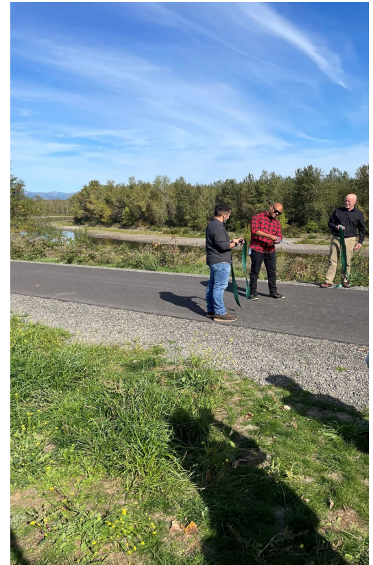
Ribbon cutting for Ch'ak Ch'ak Trail opening – A previously Regional Flexible Fund Step 2 awarded 5 project.