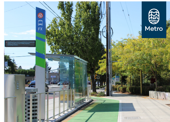
Exhibit A to Resolution 24-5415