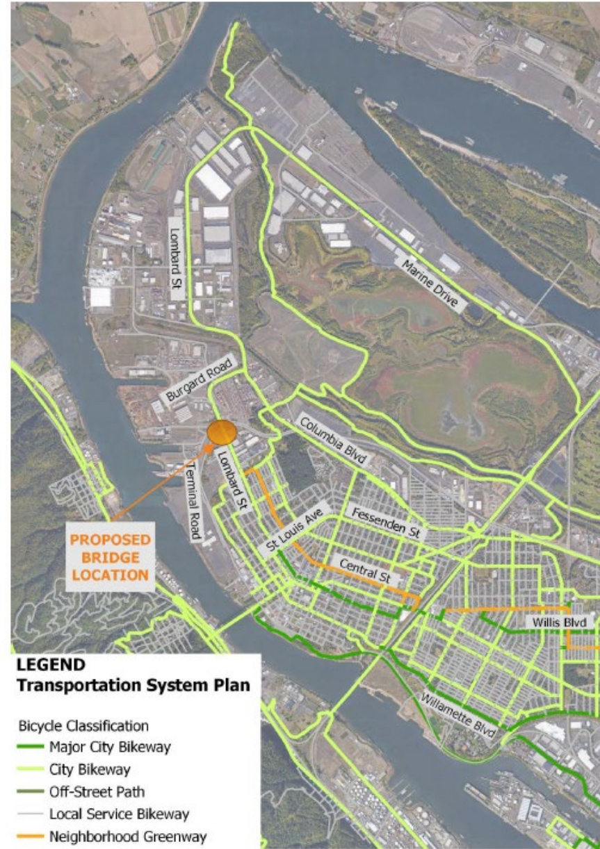
Figure 1. TSP Classifications for the Bicycle Network