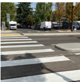
Enhanced Pedestrian Crossings