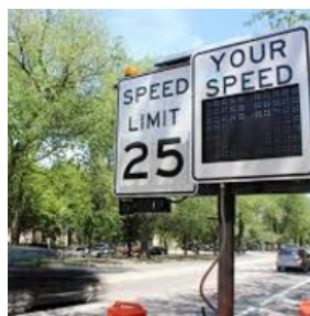
Lower speed limits and adjusted signal timings