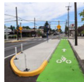
Improved bike lane design

Visit our website and sign up for project email updates: Portland.gov/BroadwayPave