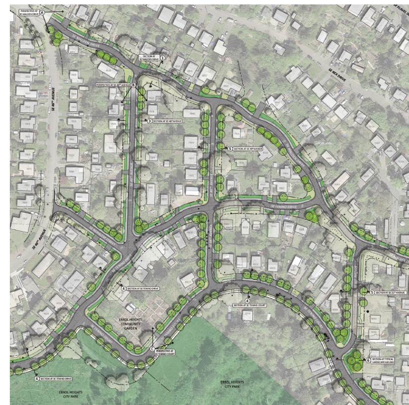
Errol Heights Street Improvements - Site Plan

As a pilot project for the City of Portland's Neighborhood Streets Program, the project is an opportunity to highlight cost-effective designs for neighborhood streets and stormwater management, which can be used in areas that would be difficult or costly to serve.