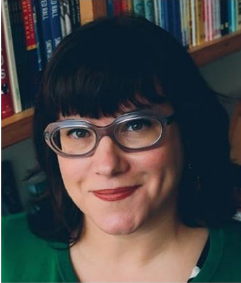
Chloe Eudaly City of Portland Transportation Commissioner