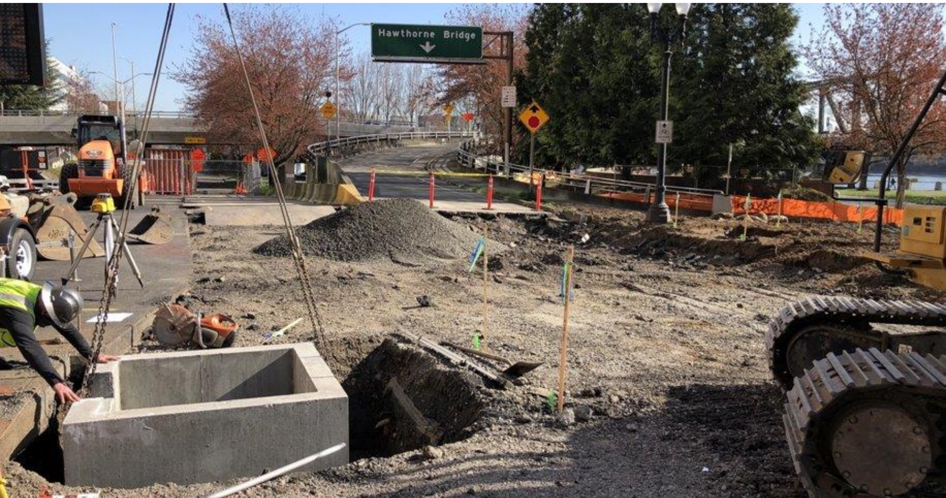
SW Naito Pkwy: I-405 – Jefferson