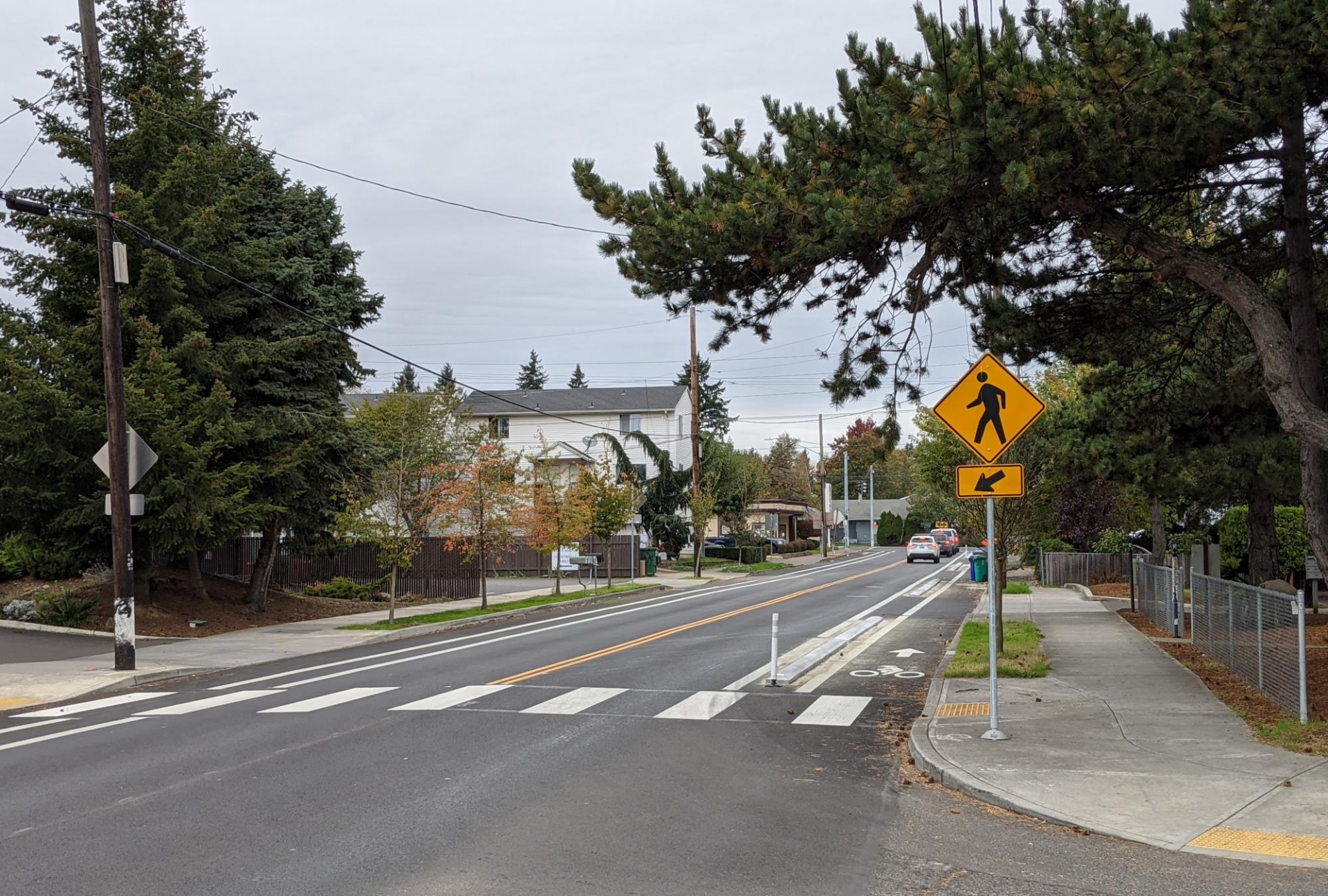
SE 136th Ave Paving and Sidewalks to Opportunity