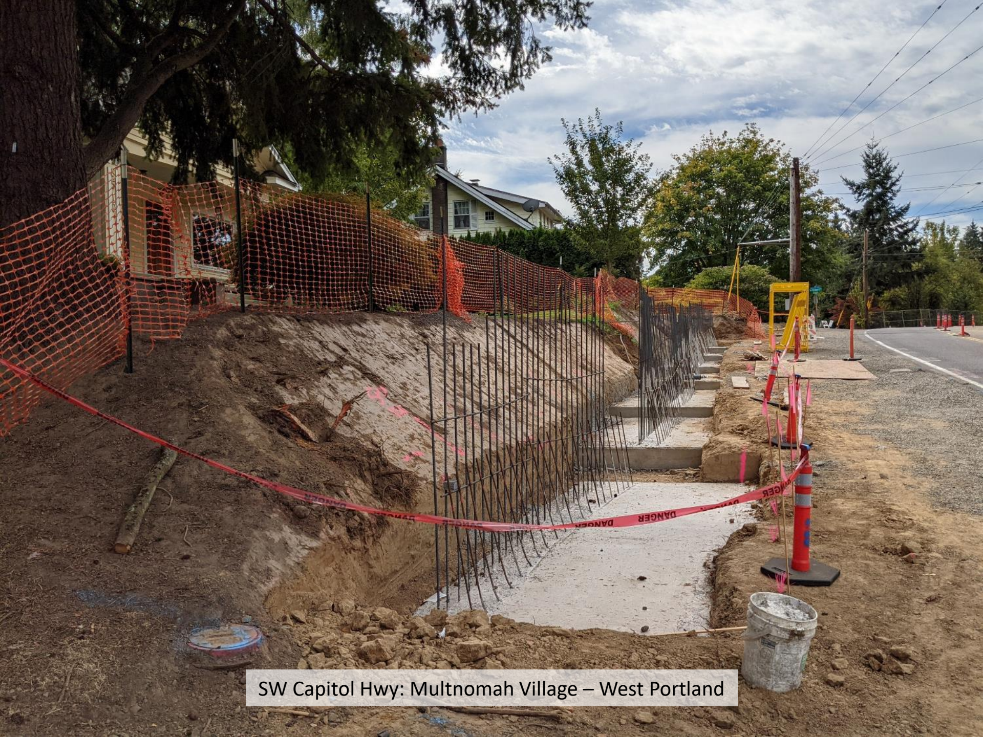
SW Capitol Hwy: Multnomah Village – West Portland