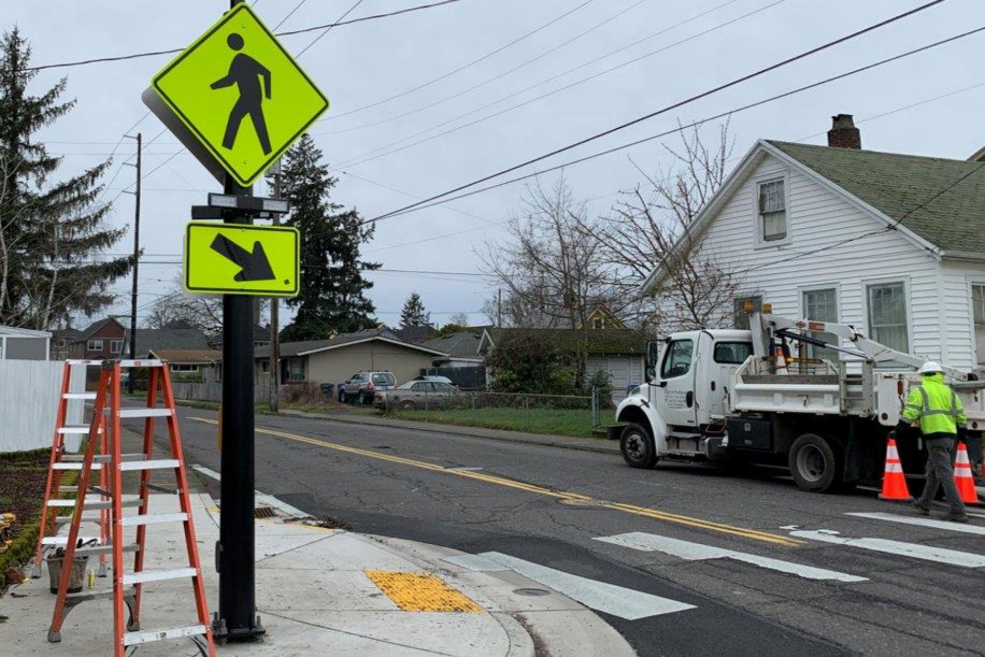
Small Capital Projects: SE Holgate/67th RRFB