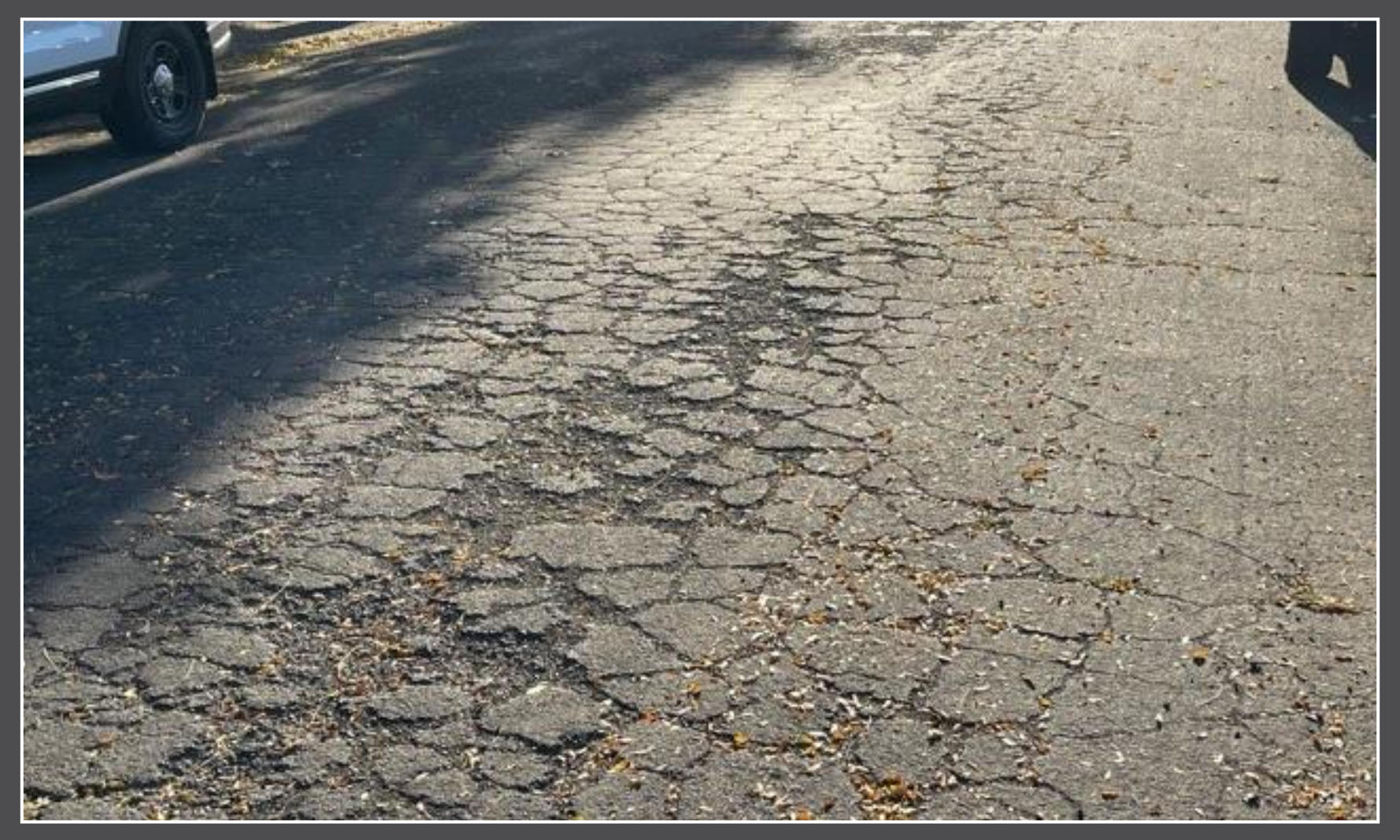
Too late - Grind it out