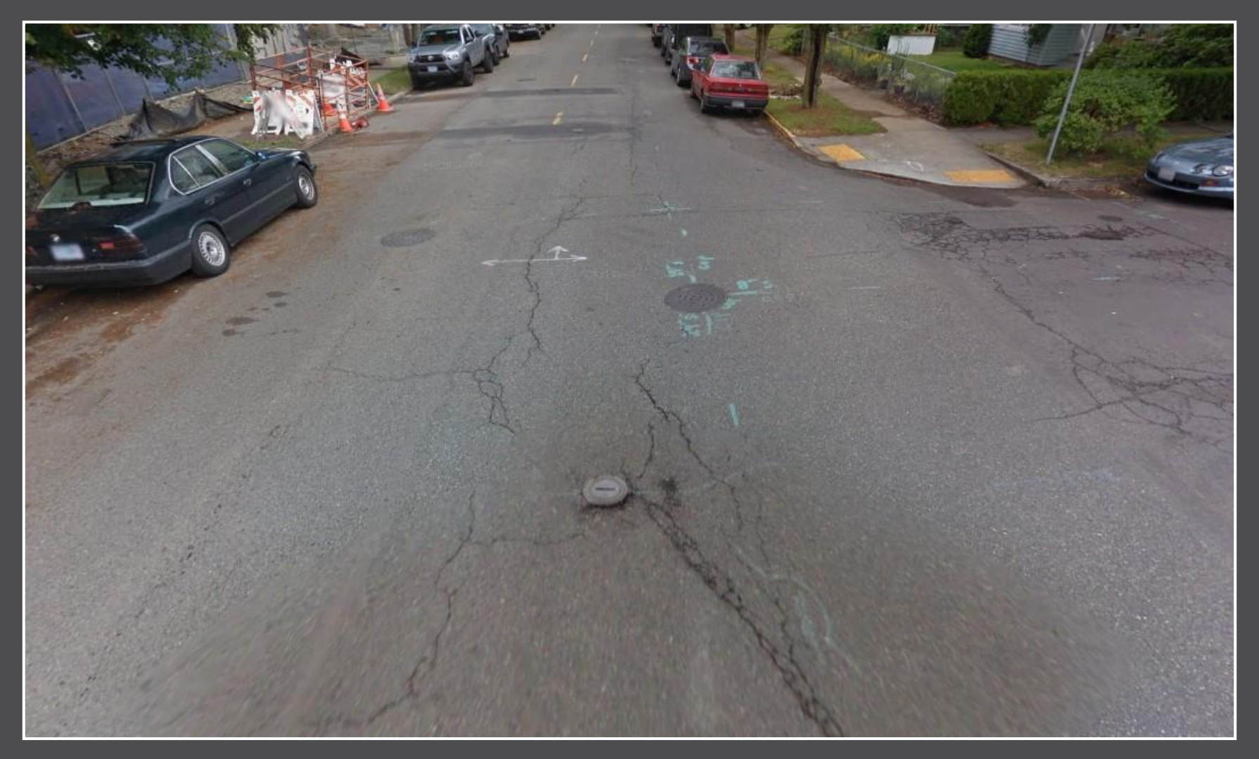
Microsurfacing – N. Ida (Before)