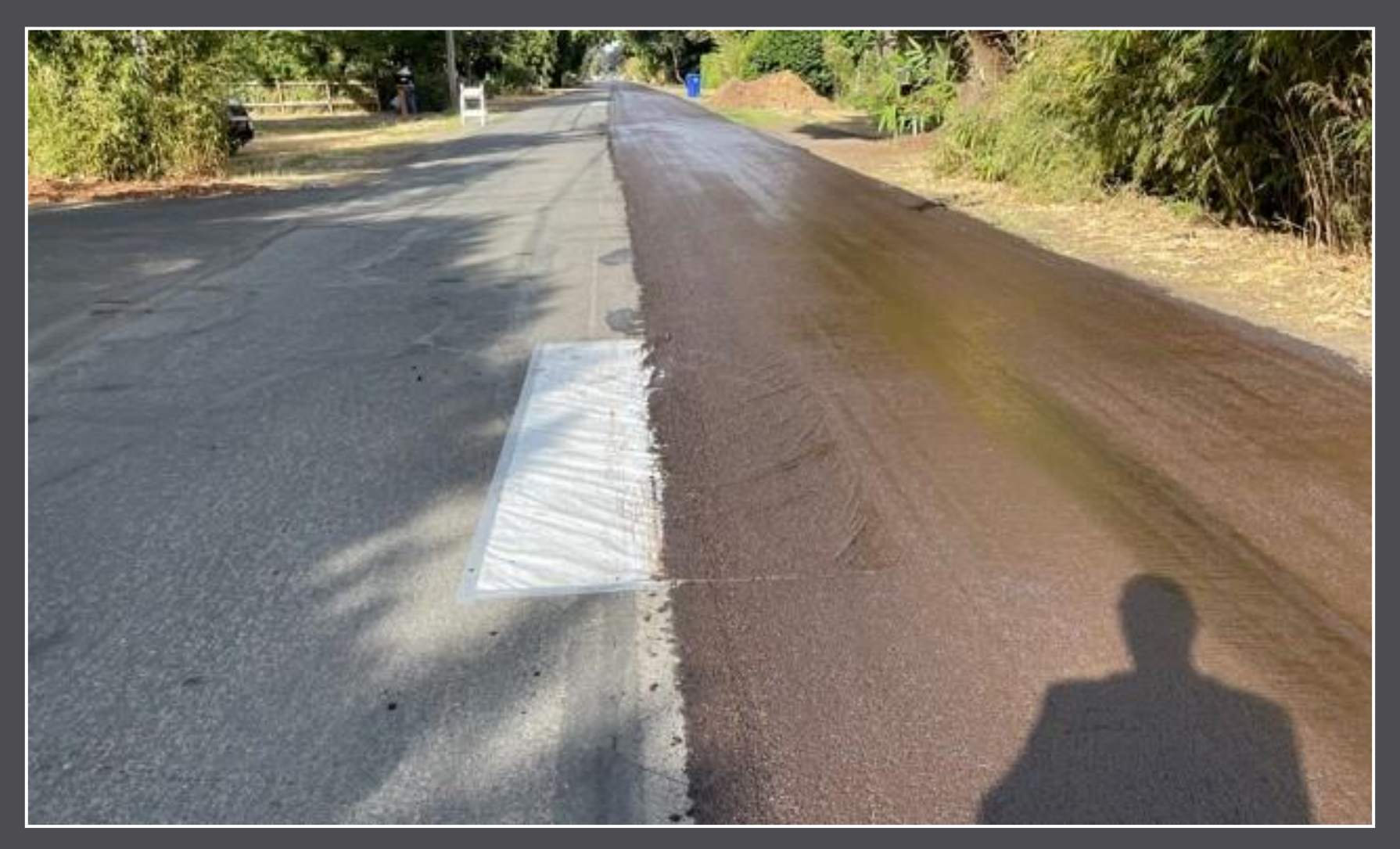
Slurry Seal (N Houghton)