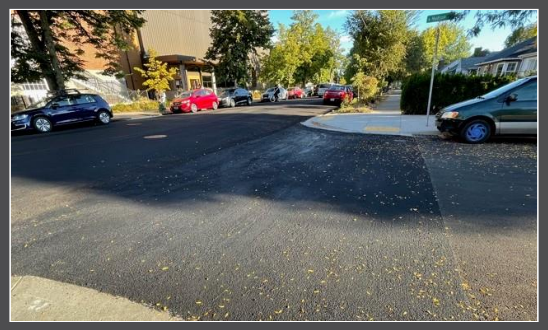
Microsurfacing – N. Ida (after)