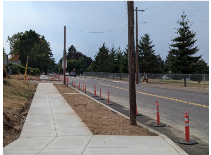
Newly constructed NE Shaver Street sidewalk looking west from the Parkrose Middle School frontage, August 2024.

This FOS1 Safe Routes to School sidewalk project on NE Shaver Street between NE 115 th Avenue and the Parkrose Middle School property is at substantial completion of construction. Unfortunately the project will close out with an estimated overage of $660,000. The overage is attributable to insufficient initial project scoping, unprecedented inflation, project delays, city and consultant staffing changes during the pandemic, right-of-way negotiation challenges, extensive property owner concerns during construction, and complex site conditions that included steep slopes, large nuisance tree removals, and deconstruction of a private koi pond.