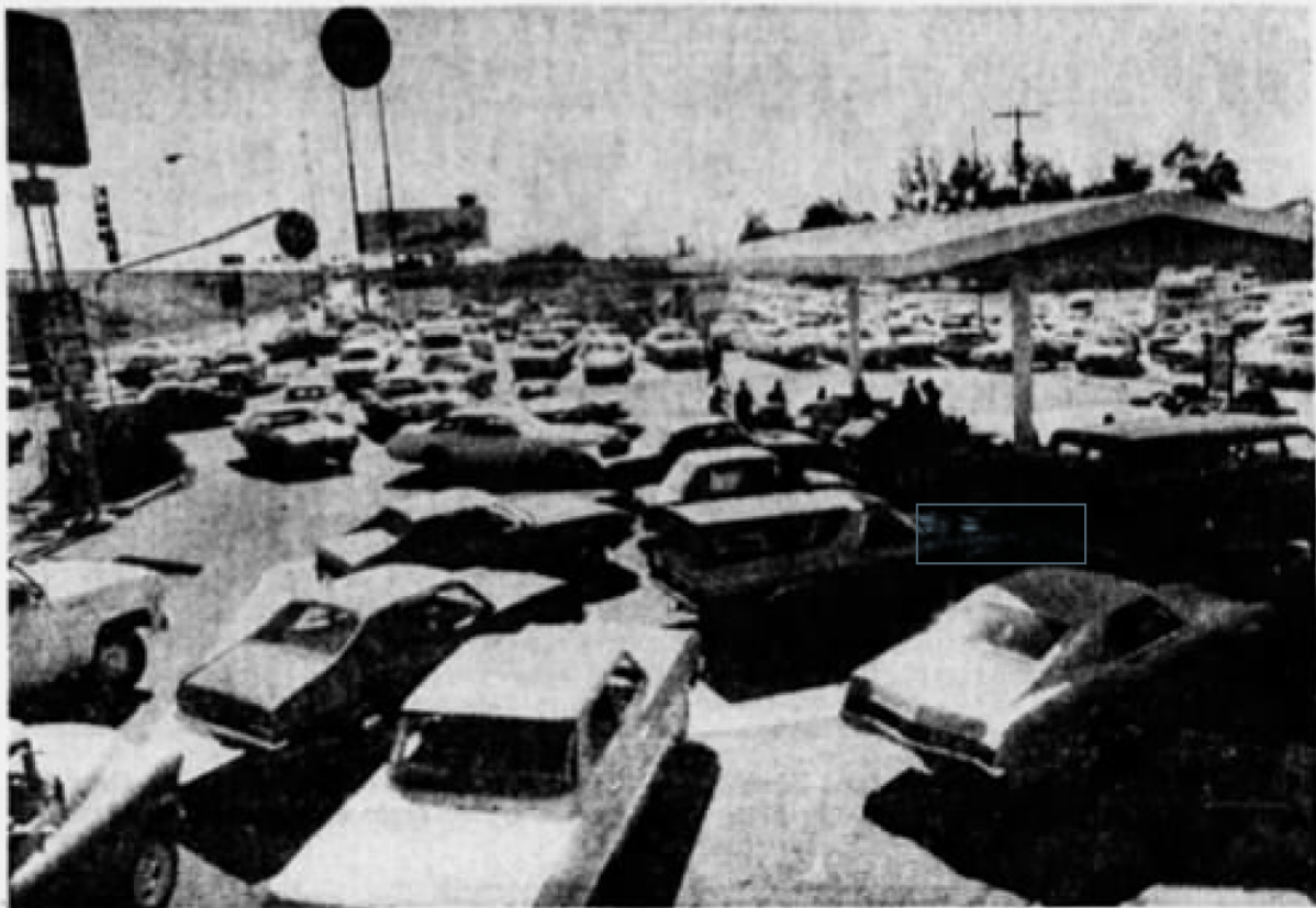
WAITING FOR GAS —About 300 cars line up to buy gasoline at service station on Interstate 10 in Tucson. Station owner Wayne Hodgson esti-

This method didn't work, for two reasons. First, the allocations didn't do anything to manage demand (they left prices low) or increase supply (with low prices, suppliers had little incentive to get new oil). The allocations only tried to spread the problem of limited supply more equitably. Second, the allocation program was voluntary, and the big oil companies didn't always abide by it. Many of them used what gas they had to prop up their own retail outlets (e.g., Exxon sent its gas to Exxon stations) and dramatically reduced their shipments to independent service stations. The independent stations began having shortages, and even some stations owned by the major oil companies found themselves running out of gasoline. As some stations ran out, drivers flocked to others. Lines started to form. Gas stations started to look like rush hour freeways: places where too many people wanted too much of something all at once.