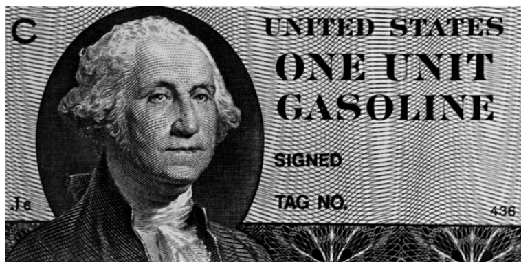
Gasoline rationing coupons, printed but never used

The United States has not had a sustained gasoline shortage since.