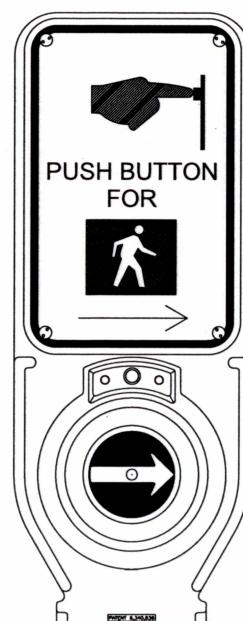
APS PUSHBUTTON AND SIGN FACE