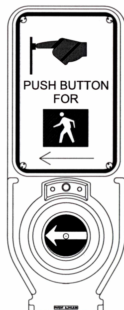
APS PUSHBUTTON AND SIGN FACE