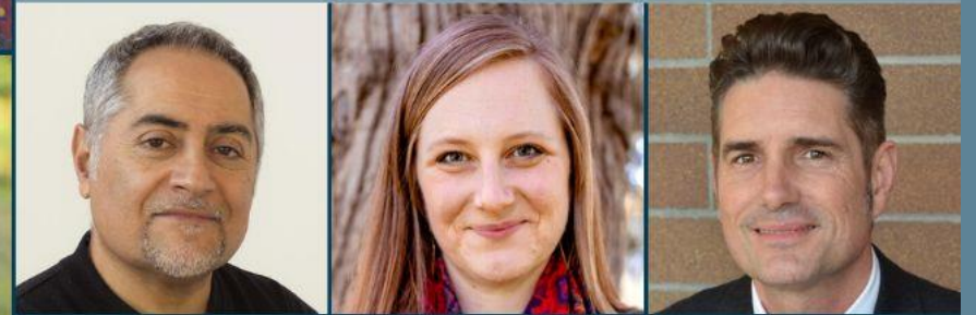
Reserve alternate members