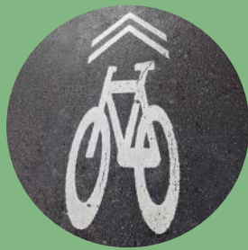
"SHARROW" STREET MARKINGS