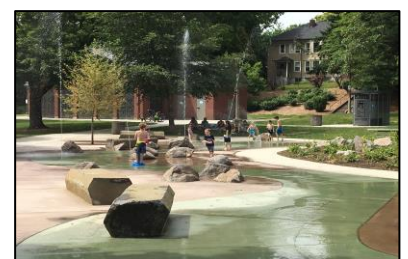
Colonel Summers Park Splash Pad