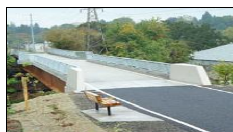
Springwater Trail Bridge