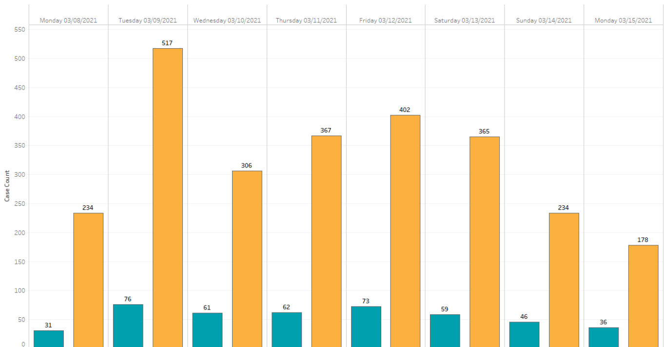
New Oregon and Multnomah County COVID-19 Cases per day