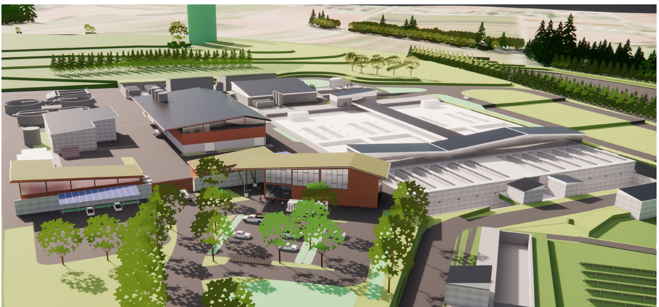
Preliminary design concept for the filtration facility.

Learn more: portland.gov/bullrunprojects