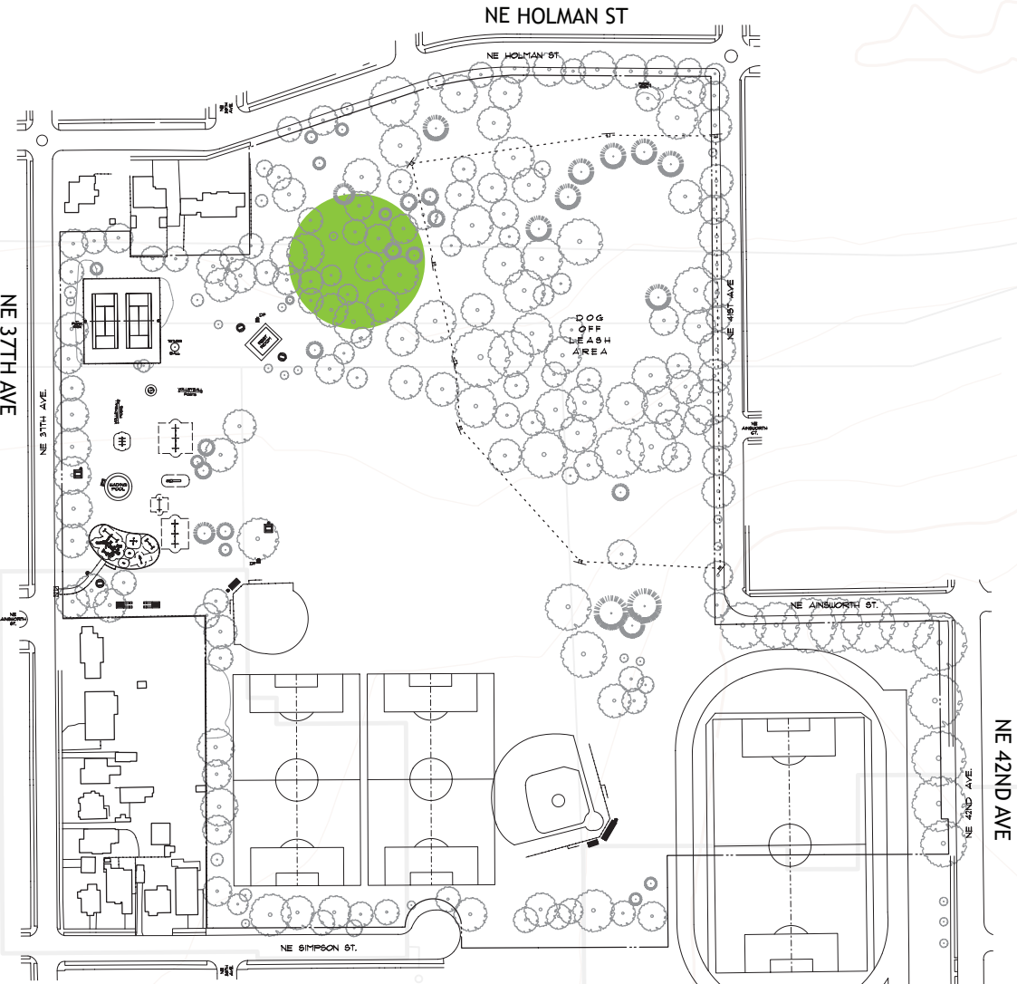
NATURE PATCH LOCATION (.60 ACRES)