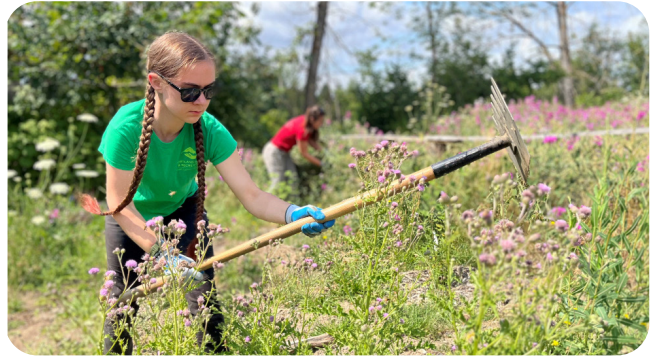
A City Nature East crew member removes introduced plants to create turtle nesting habitat at Whitaker Ponds Nature Park.

The Youth Conservation Crew program significantly increases the number of Portland Parks & Recreation staff working to improve our parks, natural areas, and trails each summer.