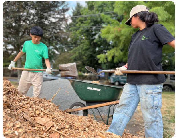
Two Crew Members in the Community Gardens Crew shovel mulch into a wheelbarrow at Woodlawn Community Garden.