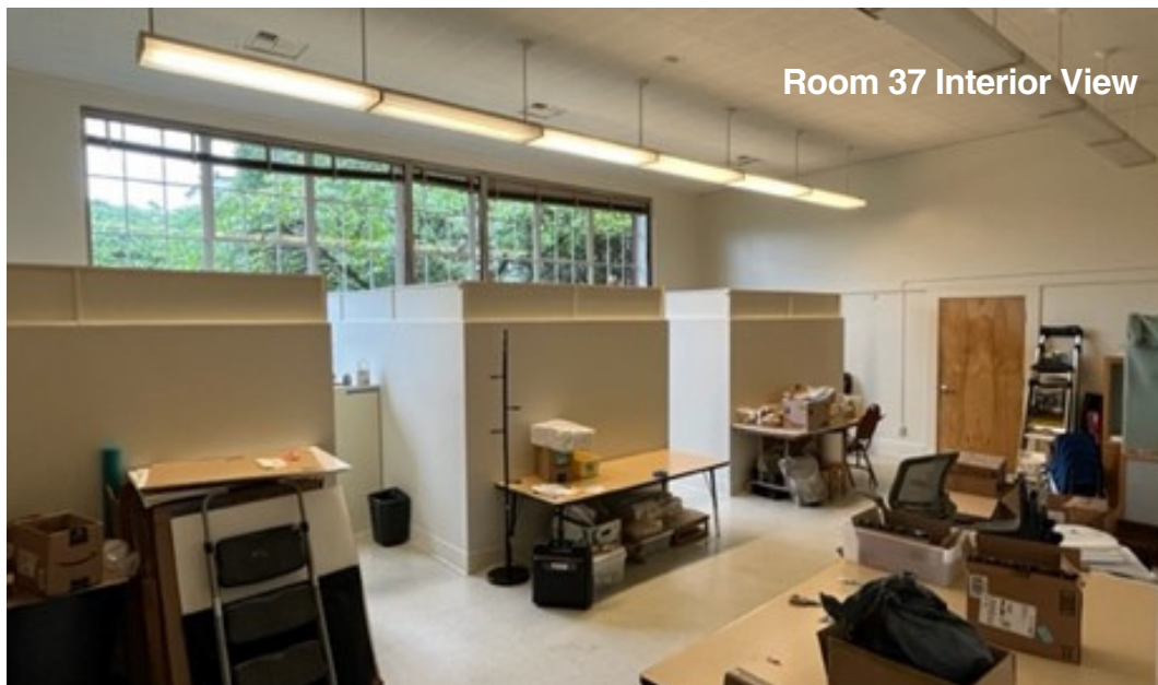
Room 37 Interior View

This room has a total of 712 square feet with 3 divided areas , shared open space, and ample storage for an office or studio space.