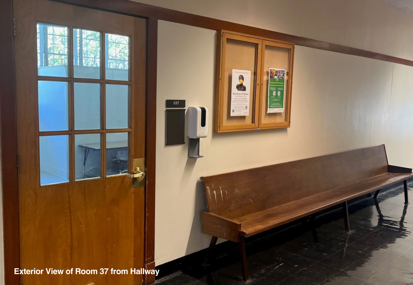
Exterior View of Room 37 from Hallway