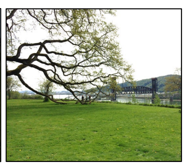
Pier/Chimney Park Bridge