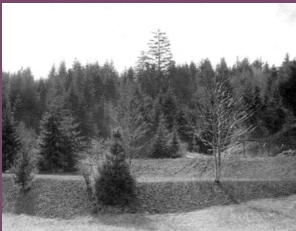
Before the roses in 1918