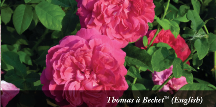
Thomas à Becket™ (English)