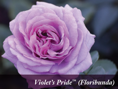
Violet's Pride™ (Floribunda)