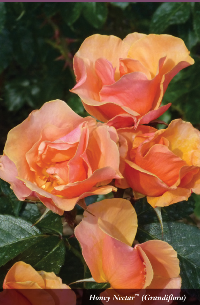
Honey Nectar™ (Grandiflora)

Roses are in bloom from late May through October, and best viewed from dawn to dusk.