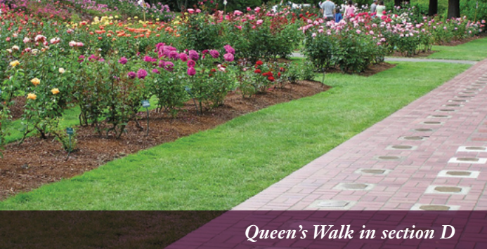
Queen's Walk in section D