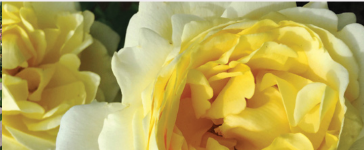
Moonlight Romantica® (Hybrid tea)