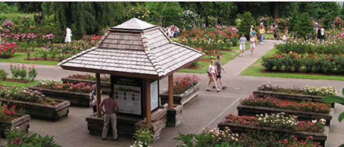
Information kiosk in section A