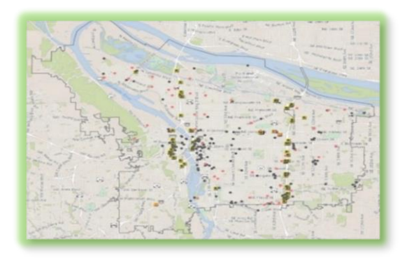
CLICK ON THE MAP ABOVE TO SEE ALL LOCATIONS REPORTED LAST WEEK

https://www.portlandoregon.gov/toolkit/article/756745