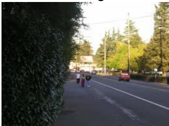
$50,000 initiated a Powell Blvd. Improvement planning project that was matched by a $330,000 ODOT grant