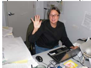
Hired an EPAP Advocate to support project implementation ($125,000)