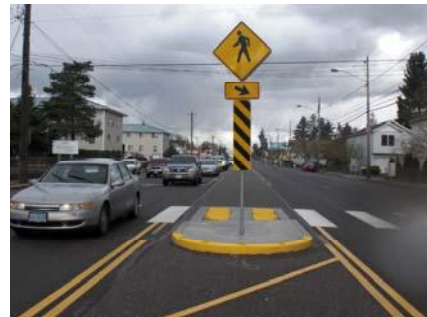
Implemented Safe Routes to School + Traffic Safety improvements ($60,000)