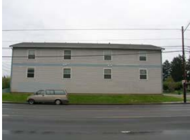
Planning for 122 nd Ave. to create a more convenient, walkable neighborhood ($30,000)