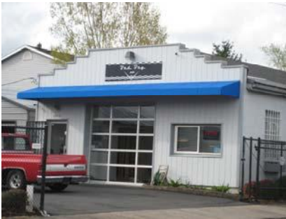
Expanded storefront improvement program for businesses ($115,000)