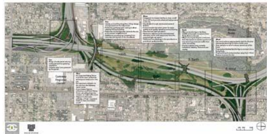
Planning “Gateway Green” (I-205/I-84) development of public space ($45,000)