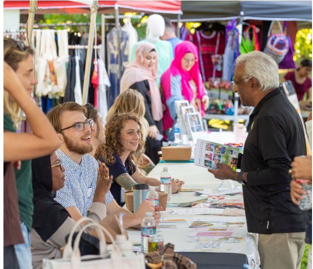
Thirty-one nonprofits and community organizations showcased their services to 1,040 people during the Welcoming Week Opening Ceremony.

In our programming this year, a central focus was ensuring that children were actively included and encouraged to celebrate Welcoming Week alongside their peers. We recognized the importance of providing them with opportunities to make friends, establish connections, and gain insights into the city