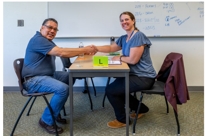
"Citizenship Day" was a day dedicated to supporting individuals seeking to become citizens of the United States.

This event epitomized the core principles of Welcoming Week, emphasizing the importance of inclusivity, support, and empowerment. It was a day where our community came together to ensure that those who aspired to become citizens had access to the necessary legal services and guidance.