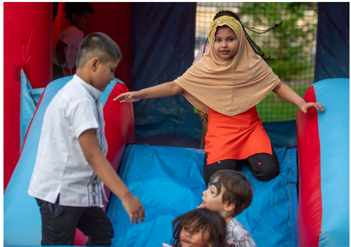
The central focus Family Fun-day in the Park was to ensure that children were actively included and encouraged to celebrate Welcoming Week alongside their peers. We recognized the importance of providing them with opportunities to make friends, establish connections, and gain insights into the city they call home.

This event exemplified our commitment to building bridges and facilitating connections within our diverse and vibrant community during Welcoming Week. At the heart of our "Family Fun-day in the Park" event was the objective to ensure that kids and families were well-informed about Welcoming Week and the diverse programming it had to offer. To achieve this, the Immigrant & Refugee team proactively distributed flyers to elementary and middle school students in the community. These informative flyers served as a vital communication tool, extending Welcoming Week's reach to young Portlanders and their families. By strategically sharing these flyers with students, we aimed to not only raise awareness about Welcoming Week but also to encourage families to participate in the festivities. This approach ensured that the event resonated with the younger generation and that they, too, could engage with the vibrant spirit of Welcoming Week.