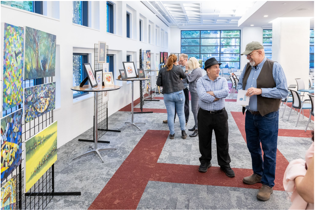
Uprooted was an art show presented in collaboration between Lutheran Community Services and Civic Life. The art collection drew inspiration from the intricate narratives of refugee identity and resilience.

This thought-provoking exhibition was a testament to the power of art to convey emotions, journeys, and aspirations that transcend language barriers. Guests had the opportunity to explore these remarkable artworks while enjoying drinks and appetizers, creating a vibrant atmosphere for dialogue and appreciation.