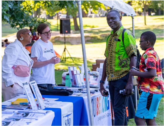
Welcoming Week's mission is to champion the creation of inclusive, secure, and fair communities that warmly embrace immigrants and refugees.

At its core, Welcoming Week encourages not just cities, towns, counties, and nations, but also the institutions within them, to fully embrace and celebrate what defines their communities as welcoming and inclusive. By doing so, we showcase how this sense of welcoming profoundly contributes to nurturing a sense of belonging for all individuals, with a particular focus on immigrants.