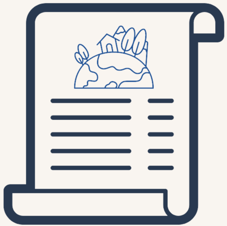
Environmental Rights & Responsibilities