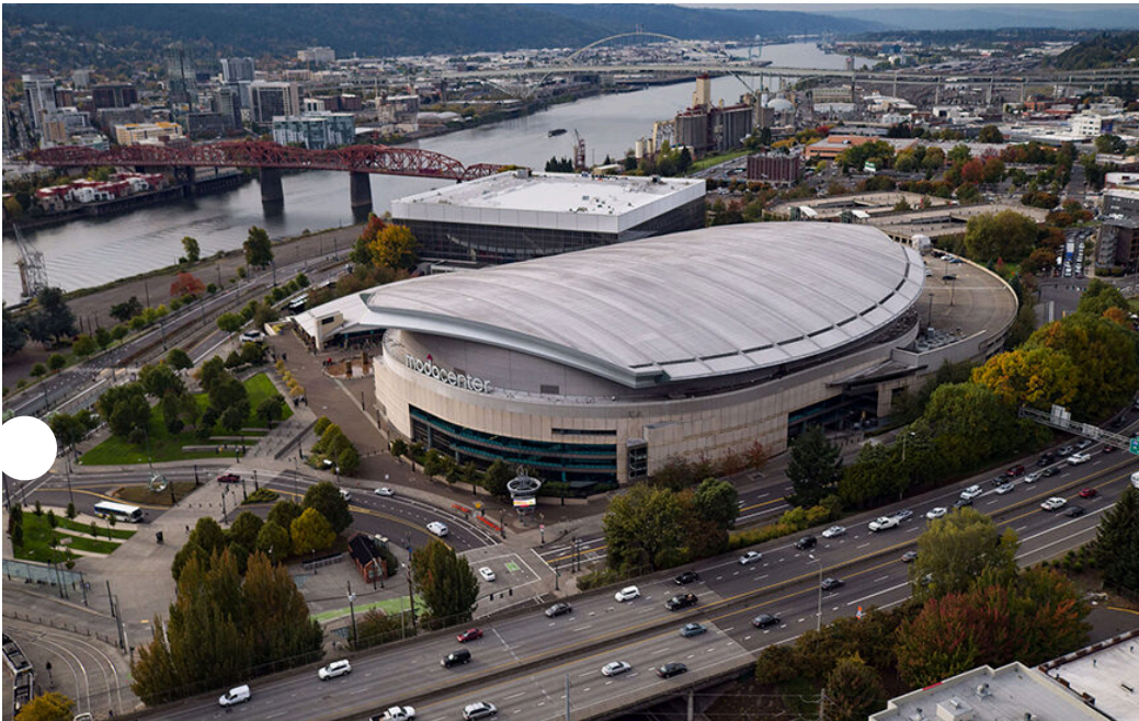
The Moda Center is one of the main buildings in Lower Albina, in North Portland. Two key neighborhood stakeholders are committed to working together on redevelopment in the area.

Home(/) > News(https://djcoregon.com/News/Category/News/) > Trail Blazers, Albina Vision Trust forge partnership