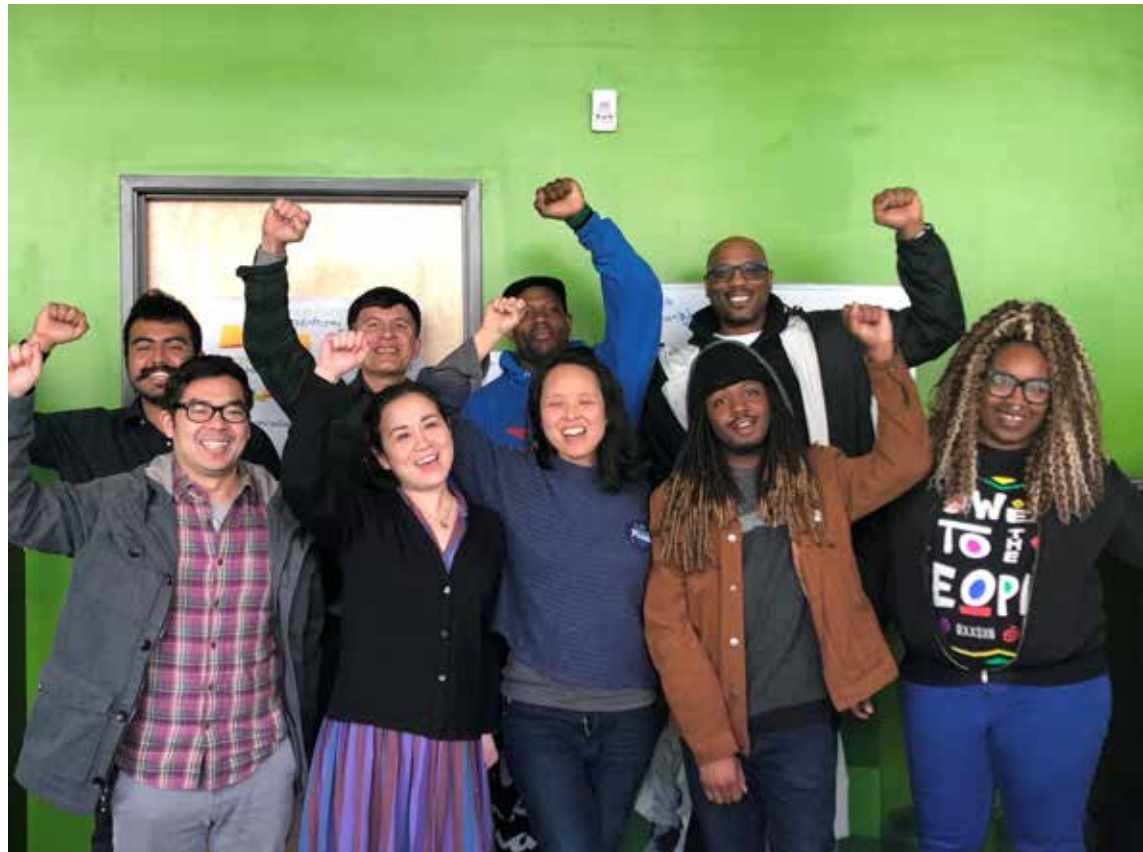
The Zero Cities Participatory Action Research Team established a model for community-led engagement and decision-making in Portland's future climate policy development.

Energy Training Session to build capacity and collective understanding of energy use in the built environment. The training session also explored the intersection of advancing racial equity and decarbonizing the building sector using an Equity Assessment Tool developed by another Zero Cities Project equity consultant, Race Forward. Training session participants joined additional community members to form a Participatory Action Research (PAR) team. PAR is a model of community organizing that builds the capacity of people on the front line of a problem to take leadership in creating the change they want. In December 2019, the PAR team hosted an all-day, all-BIPOC Community Forum on Buildings and Energy.