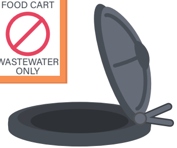
DUMP STATION (WITH LID)

Food cart pods seeking a solution to wastewater disposal can install a dump station and connection to the sanitary sewer. Learn more about the process to connect.