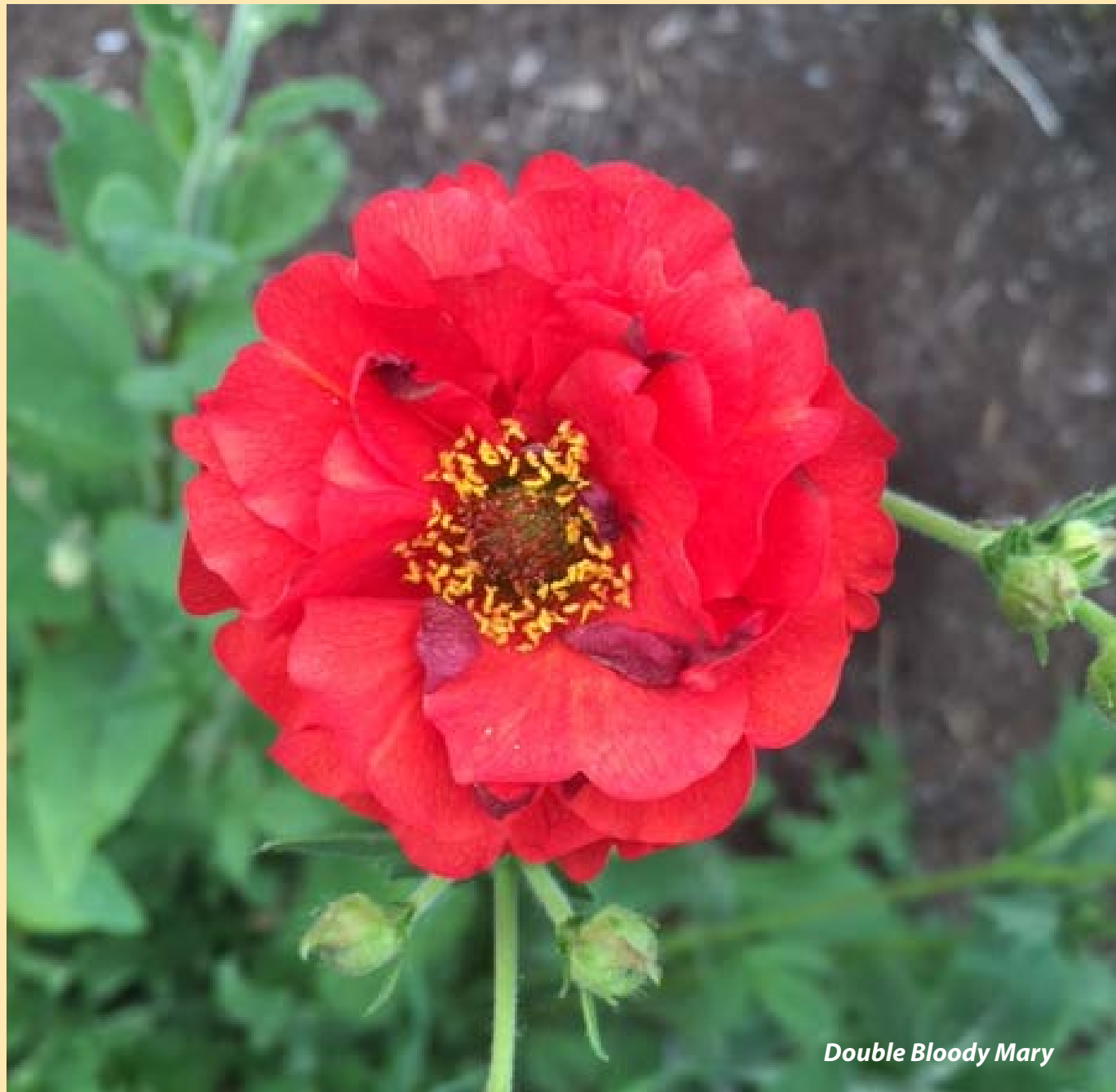
Double Bloody Mary