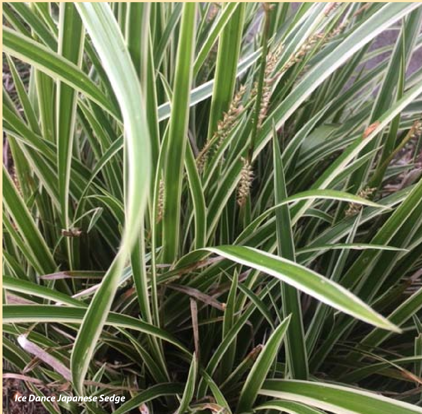
Ice Dance Japanese Sedge

SEDGES & GRASSES | EVERGREEN | GS ZONE B