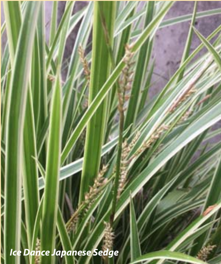
Ice Dance Japanese Sedge