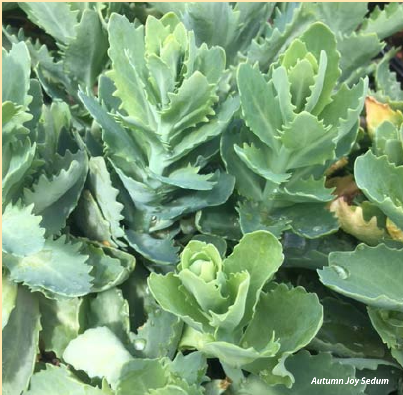
Autumn Joy Sedum