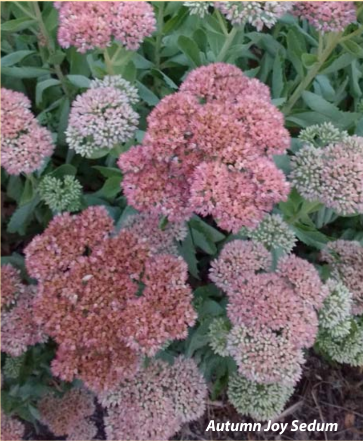
Autumn Joy Sedum