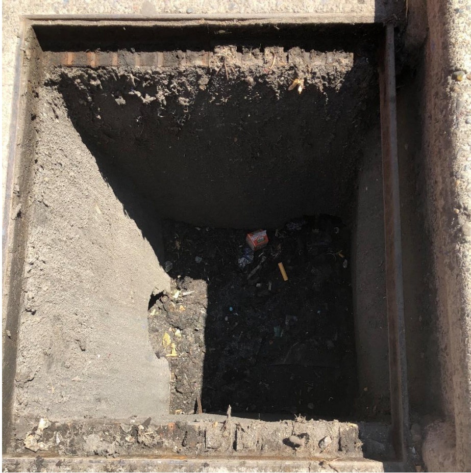
AQL329, SW 3rd and Main, west corner NW of AQL328