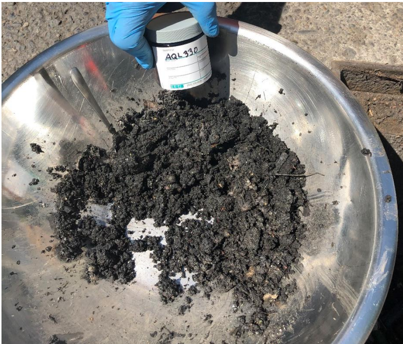
AQL330, catch basin sample, SW 3rd and Main, north corner