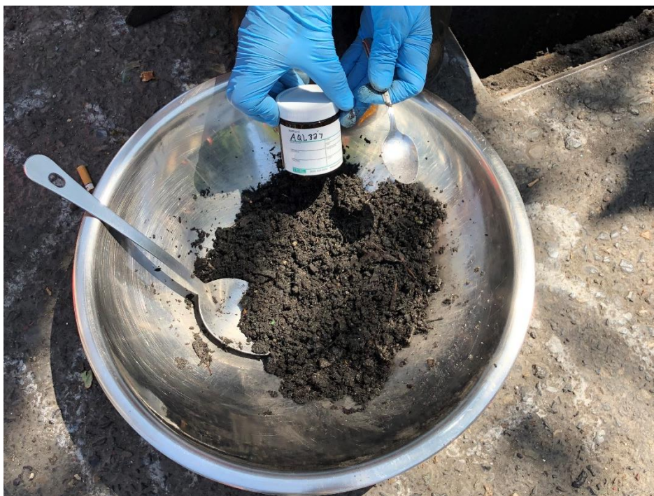
AQL327, catch basin sample, SW 3rd and Main south corner