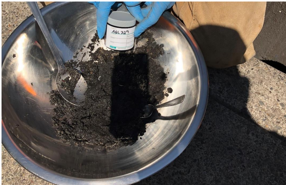
AQL329, catch basin sample, SW 3rd and Main, west corner NW of AQL328