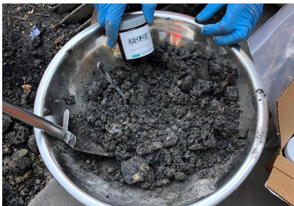
AQY840, catch basin sample of material accumulation adjacent to catch basin, SW 3rd and Salmon, west corner