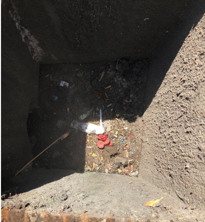
AQL328, SW 3rd and Main, west corner