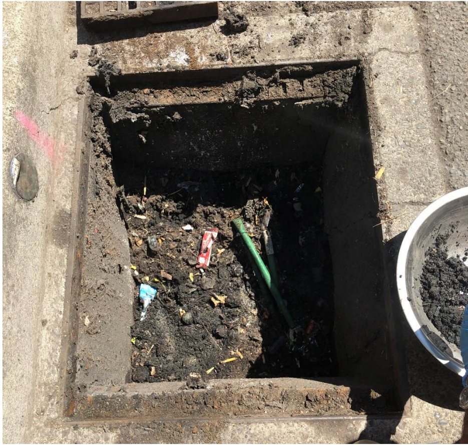
AQL330, SW 3rd and Main, north corner