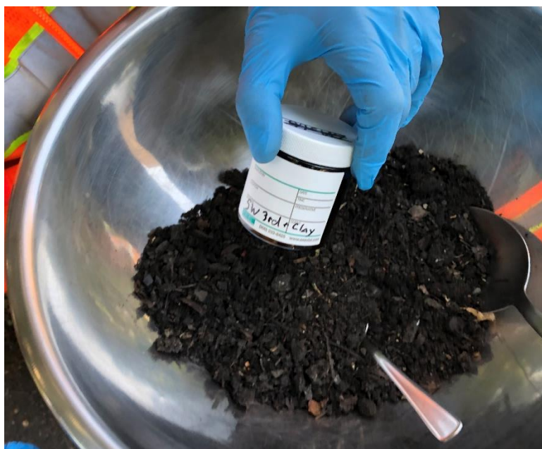
AMU048, catch basin sample, SW 3rd and Clay (control site)