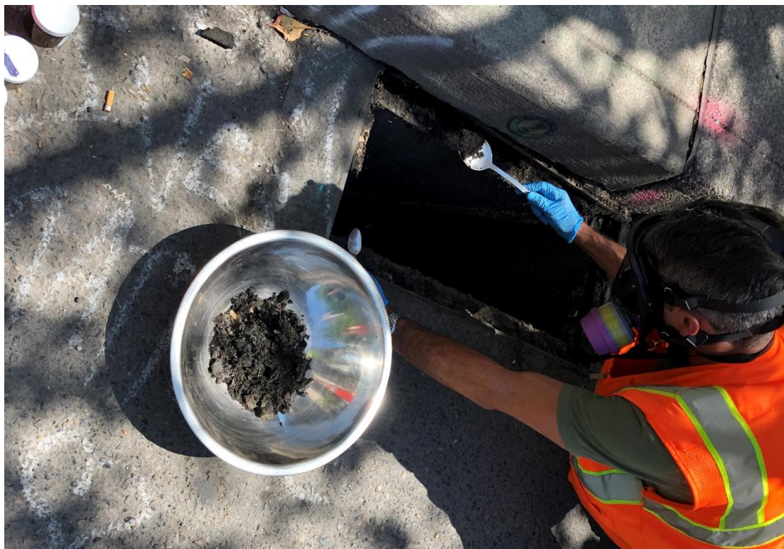
AQL327, SW 3rd and Main south corner