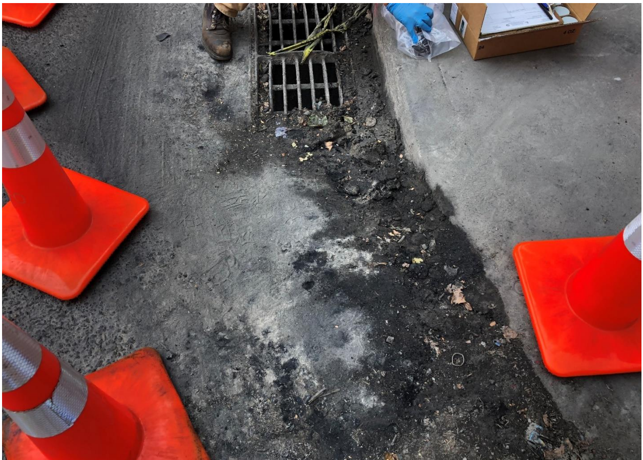
AQY840, sampled material accumulation adjacent to catch basin, SW 3rd and Salmon, west corner