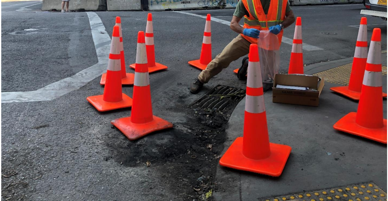
AQY840, SW 3rd and Salmon, west corner