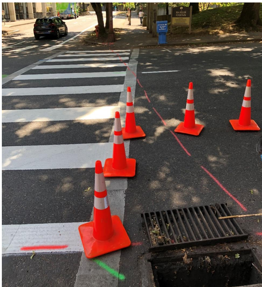
AMU048, SW 3rd and Clay (control site)