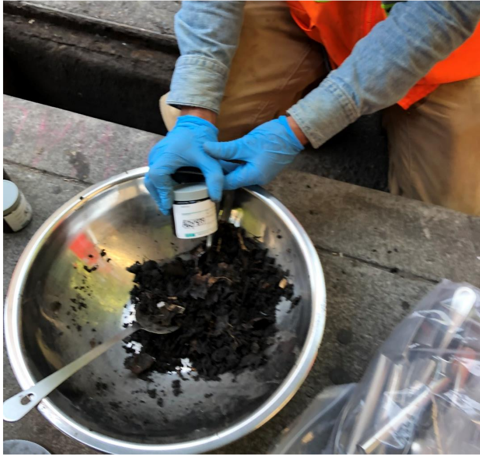
AQY839, catch basin sample, SW 3rd and Salmon, north corner