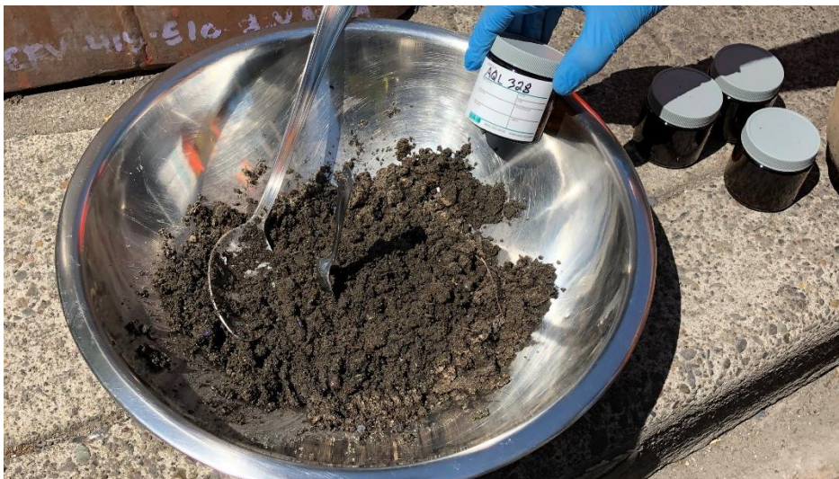
AQL328, catch basin sample, SW 3rd and Main, west corner