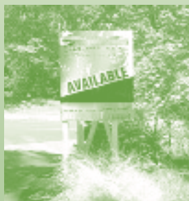
Examples of a properly displayed temporary lawn sign and a temporary freestanding sign

For more detailed information regarding the bureau's hours of operation and available services;