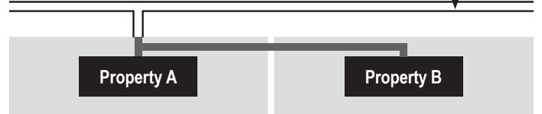
Diagram 2 Connection with Direct Route of Service